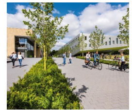
Campus Osnabrück University of Applied Sciences and Osnabrück University