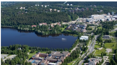
University of Eastern Finland – Kuopio Campus

Deadline for application: 26th November 2021