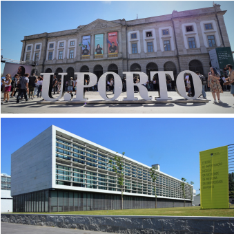
CINTESIS / Faculty of Medicine University of Porto

The module Interoperability in Healthcare will provide you with a perspective of the wide spectrum of problems in the field of Health Information Systems interoperability, its implications in Healthcare and paths to promote coherent and safe information exchange . It reinforces the important role of standards in fostering interoperability and provides a hands-on approach creating the opportunity for you to experience scenarios where information exchange occurs, putting you in the driver's seat while reaching for a solution.